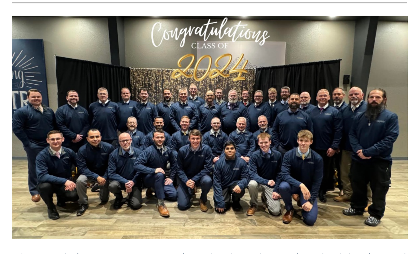
Congratulations to our newest Institute Graduates! We enjoyed celebrating and recognizing you all this weekend!